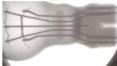
Connections within a light bulb.