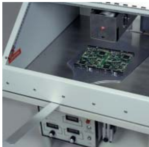
Lixi's 'pizza paddle' allows the operator to position parts quickly, easily and accurately.